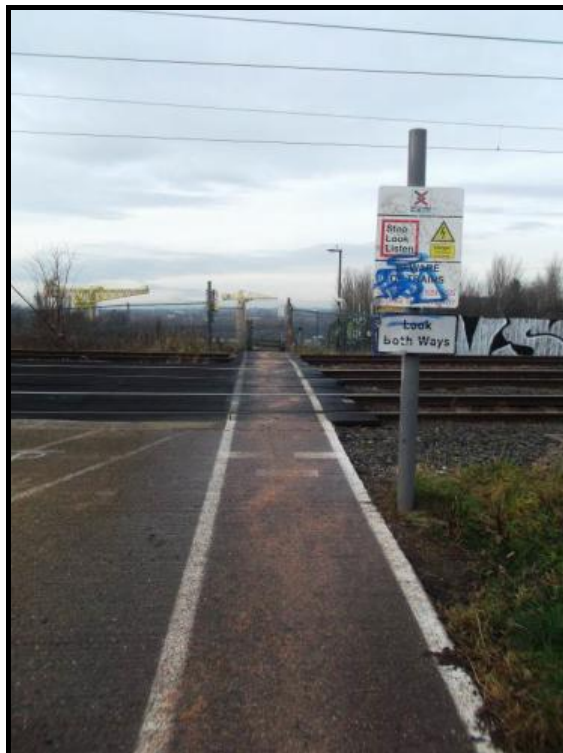
Photograph illustrating length of crossing and partially obscured signage

As the surface of the crossing is nominally level, the assumed walking speed can be taken as 1.2m/s. Using the distance between decision points of 16 metres, this equates to a crossing time of approximately 13.3 seconds. The Nexus whistle boards in the In Shields (Down) direction give approximately 17 seconds warning whilst those in the Out Shields (Up) direction give approximately 26 seconds. These warning times assume, of course, that train drivers sound their horn, that users are not hard of hearing or wearing headphones and are not distracted by background noise or dogs.