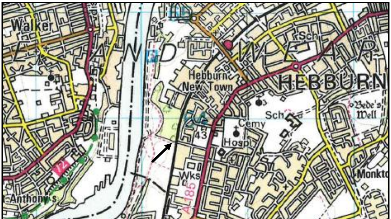
Extract from OS Map illustrating crossing in relation to surrounding topography