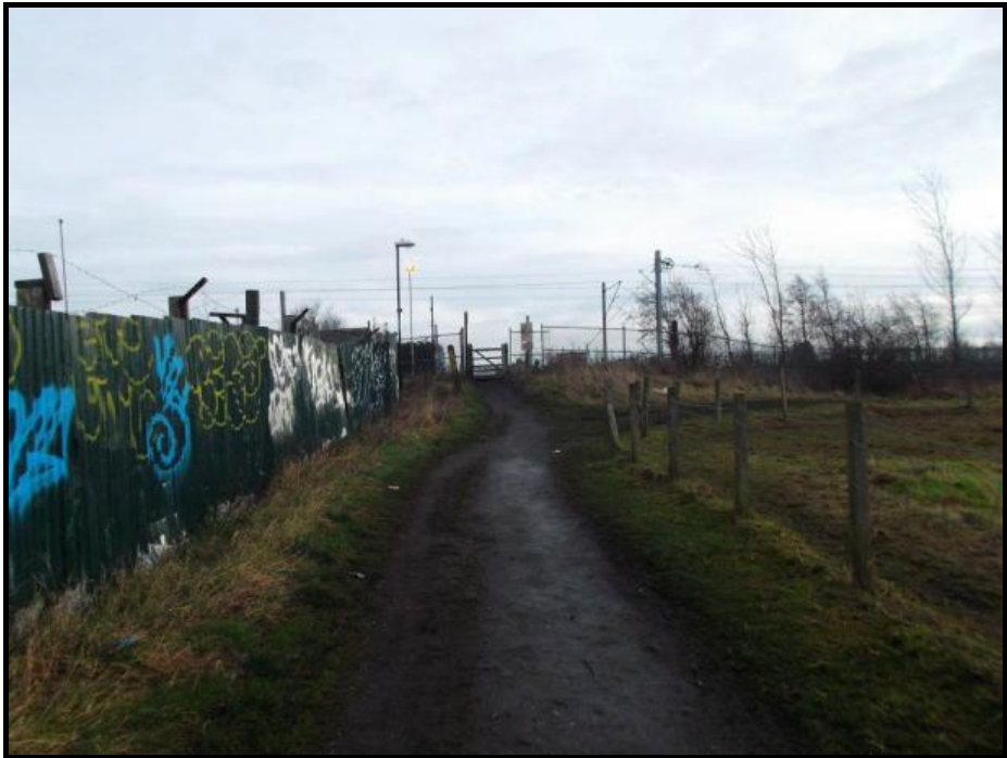
Photograph illustrating Riverside Park approach to level crossing

The approach from Riverside Park is by means of an illuminated and surfaced pathway. The path leads down to the main area of the park, the River Tyne and National Cycle Network no.14.