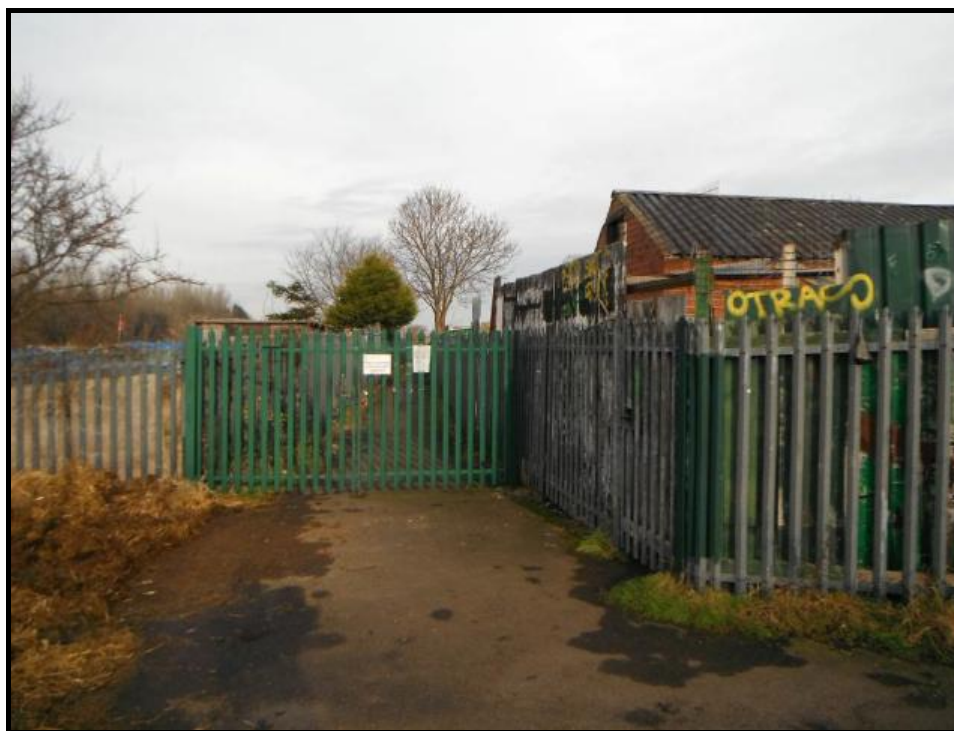
Photograph illustrating padlocked gate forming rear access to allotments

The crossing forms a link between the housing areas to the East of the railway and Riverside Park, allotments and National Cycle Route No. 14. A padlocked gate forms the rear entrance to a central avenue giving access to the allotments.