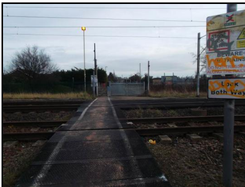
Photograph illustrating length of crossing and signage obscured by graffiti

Warning times i.e. the time from when an approaching train can first be seen to subsequent arrival at the crossing, are estimated below. Note that values are only estimates as In practise accurate values can only be established by standing at the decision points and using specialist equipment 1 .