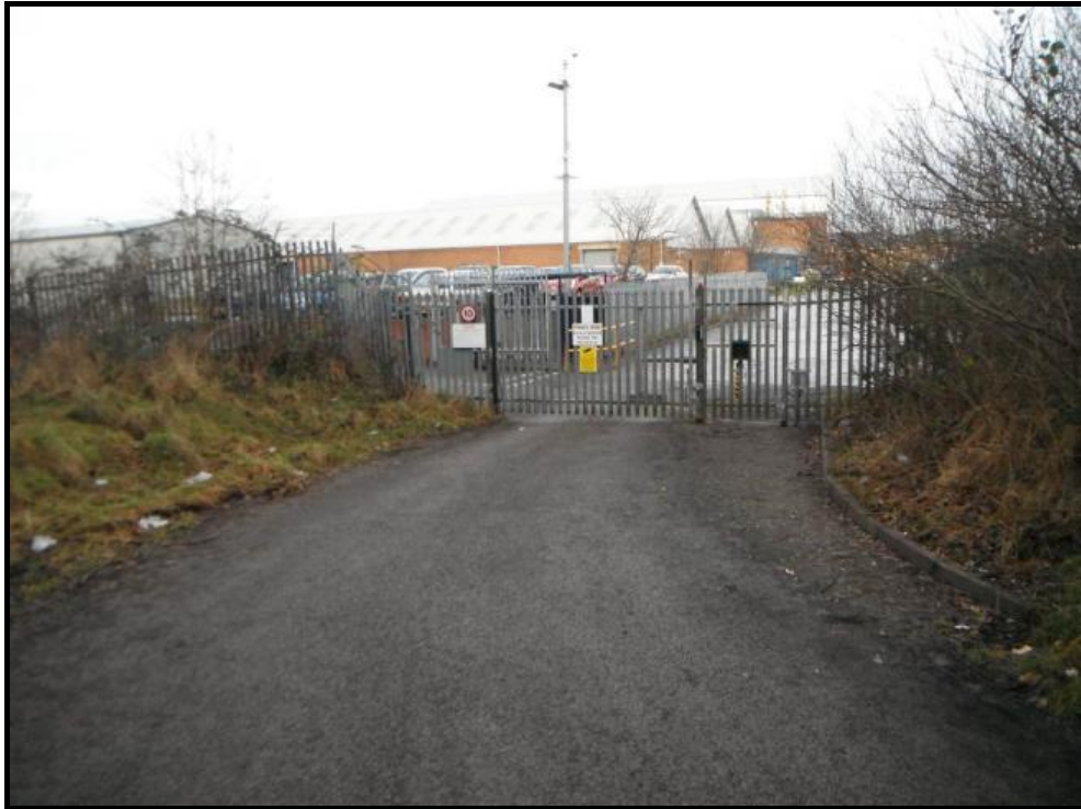
Photograph illustrating vehicular access to allotments with Siemens site in background