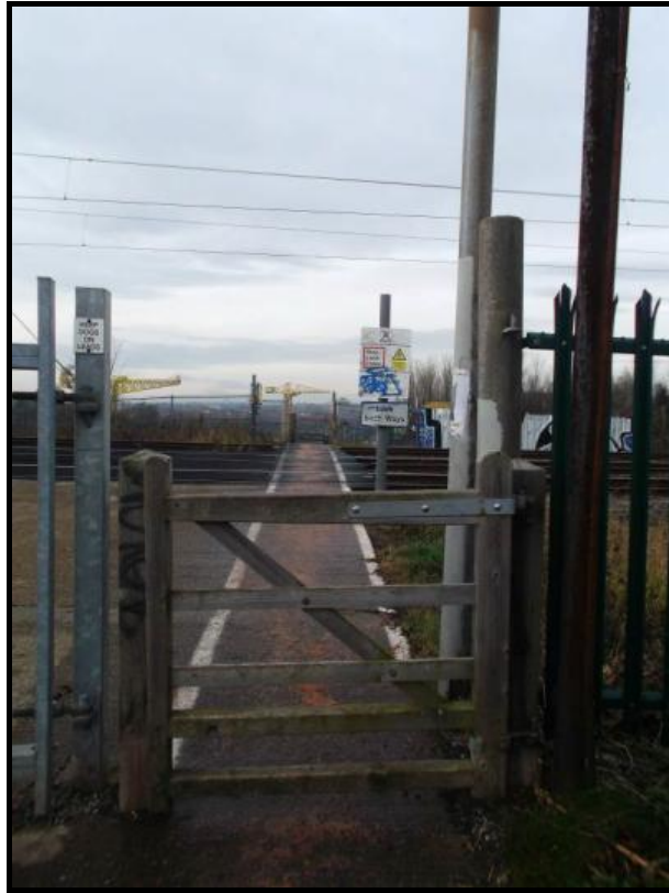
Photograph illustrating access gate to level crossing from South Drive