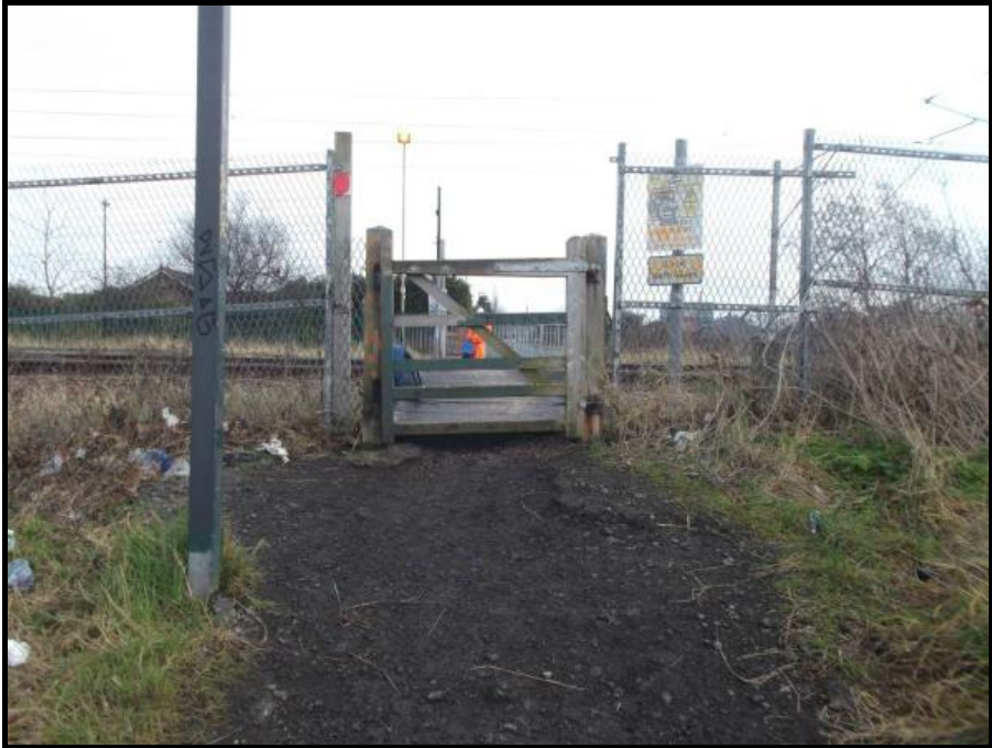
Photograph illustrating Riverside Park access gate

Although the level crossing is accessible for all mobility impaired persons from South Drive, people who have difficulty taking a step of more than 12-15cm would not be able to use the Riverside Park gate.