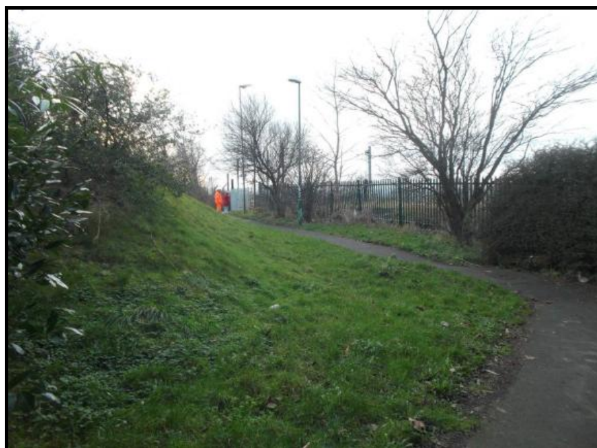
Photograph illustrating access from existing residential area

At the level crossing, there is also a footpath from Woodvale Close. This appears to be adopted and is lit.