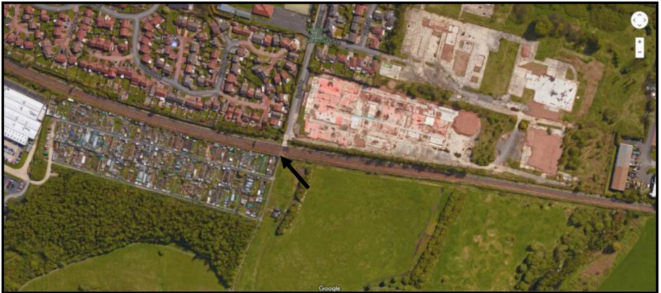
Photograph illustrating level crossing in relation to proposed development site (top right), allotments and Riverside Park (bottom left)