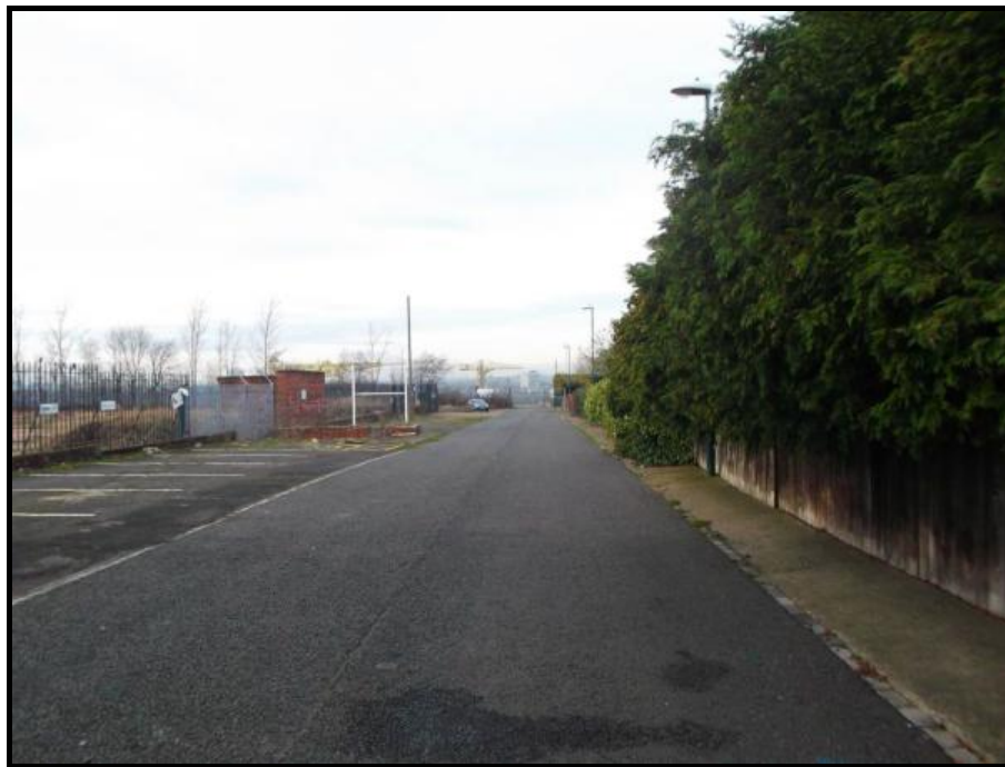
Photograph illustrating South Drive approach to level crossing

The approach from South Drive is by means of an adopted road. The Miller Homes development site is to the left of the picture.